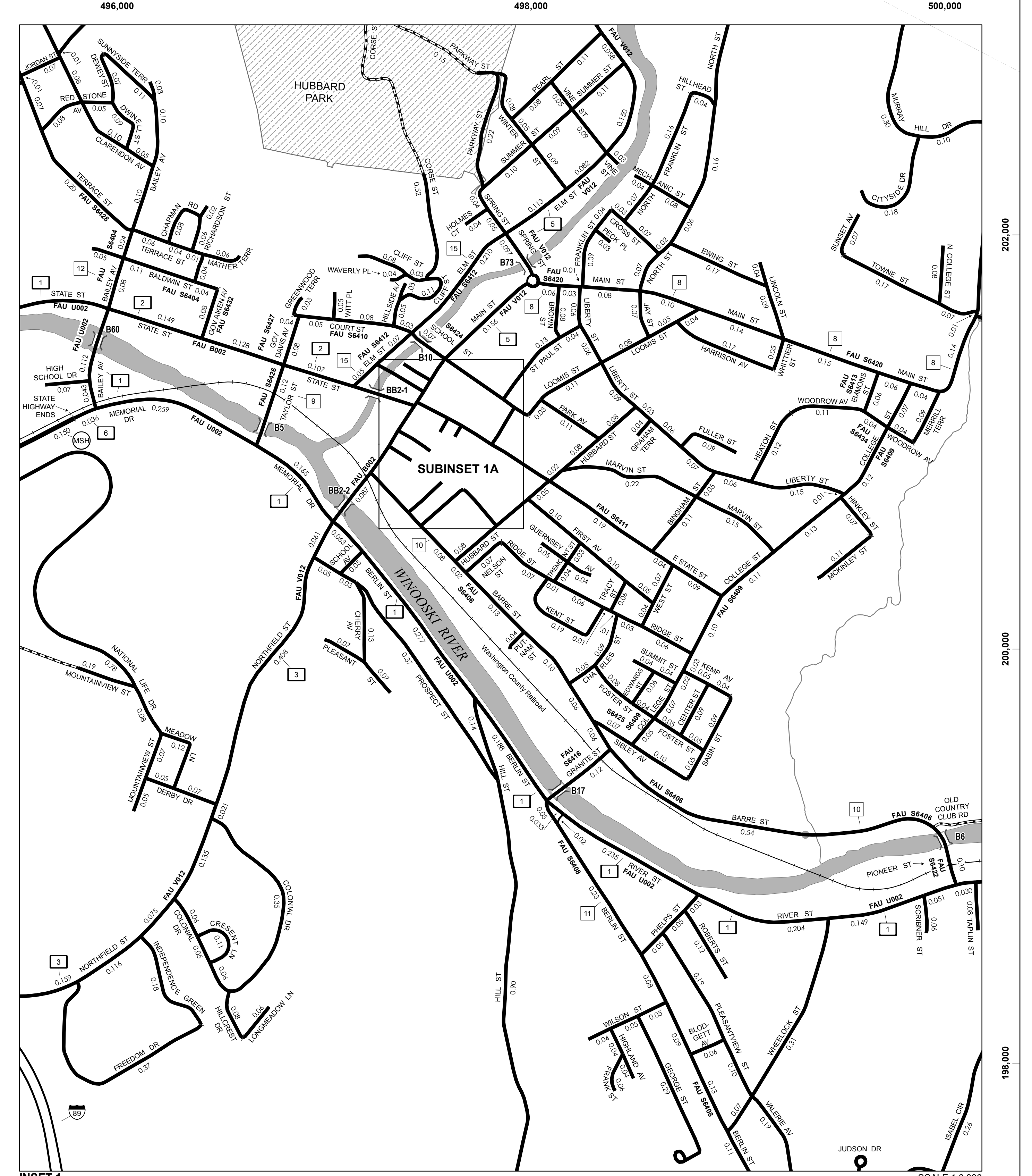
INSET 1 SCALE 1:6,336

DISCLAIMER: The untraveled highways (laid-out town highways), discontinued highways, and legal trails hereon are those of which the Agency of Transportation has record; others may exist. Highway and bridge data by the Agency of Transportation. Town short structures are drawn from the Vermont Online Bridge & Culvert Inventory Tool (VOBCIT) database. All other data from the Vermont Center for Geographic Information. Only named streams are shown. Vermont State Plane Coordinate System North American Datum of 1983 SPCS Zone Identifier: 4400 Geodetic Reference System 80 2,000-meter grid, Easting - Northing