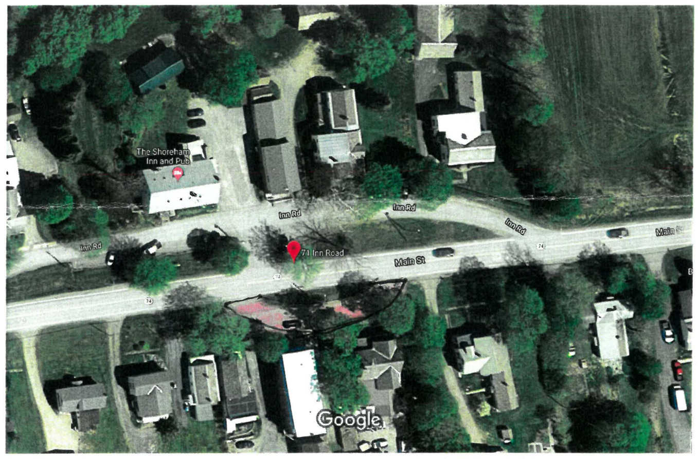
50 ft